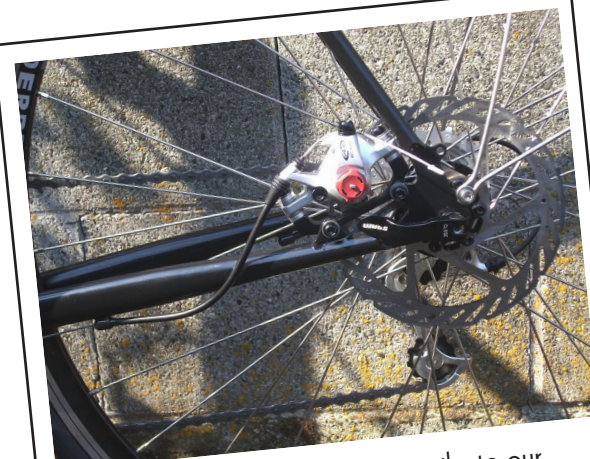
The Rodriguez Phinney Ridge is similar to our Rainier, but uses disc brakes instead of tratitional road brakes. While not as light as the Rainier, the Phinney Ridge is no heavy-weight.